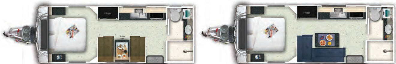
Great Northern RD

*Disclaimer: The information contained within this brochure is provided for information purposes and intended as a guide only. Prices, photographs, floor plans, caravan specifications and model features, warranty information and standard inclusions are subject to change at any time.